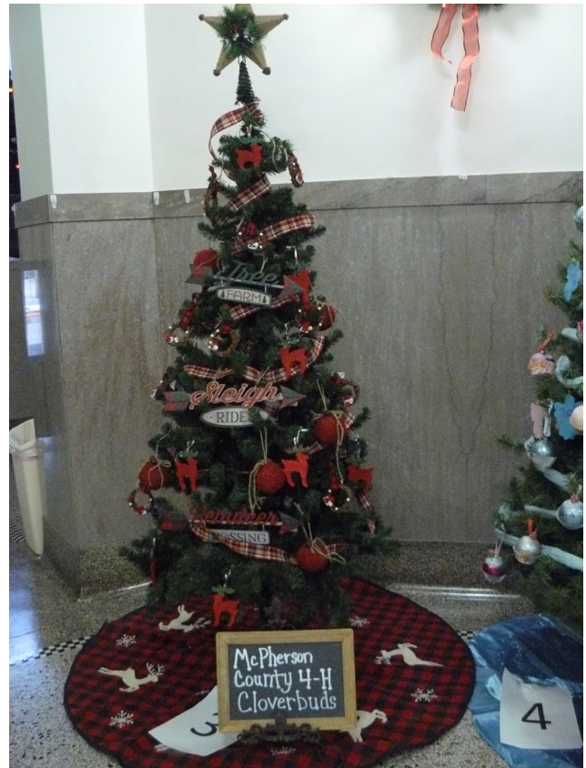
The Cloverbud tree at the Courthouse

The ownership forms are due in the office on June 1, 2018. I will also collect them on the 21st.